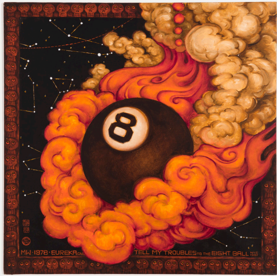
Martin Wong Tell My Troubles to the Eight Ball (Eureka) , 1978—81 Acrylic on canvas 121,9 x 121,9 cm