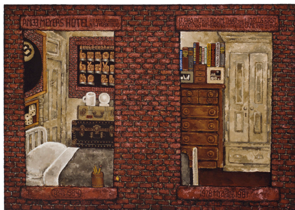
Martin Wong My Secret World 1978—81, 1984 Acrylic on canvas 121,92 x 172,72 cm