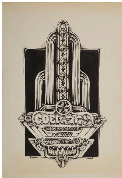
Martin Wong Cockettes now appearing at Midnite at the Palace , 1970 Ink on paper 44,45 x 30,48 cm Courtesy of the Martin Wong Foundation and P.P.O.W, New York and Galerie Buchholz © Martin Wong Foundation