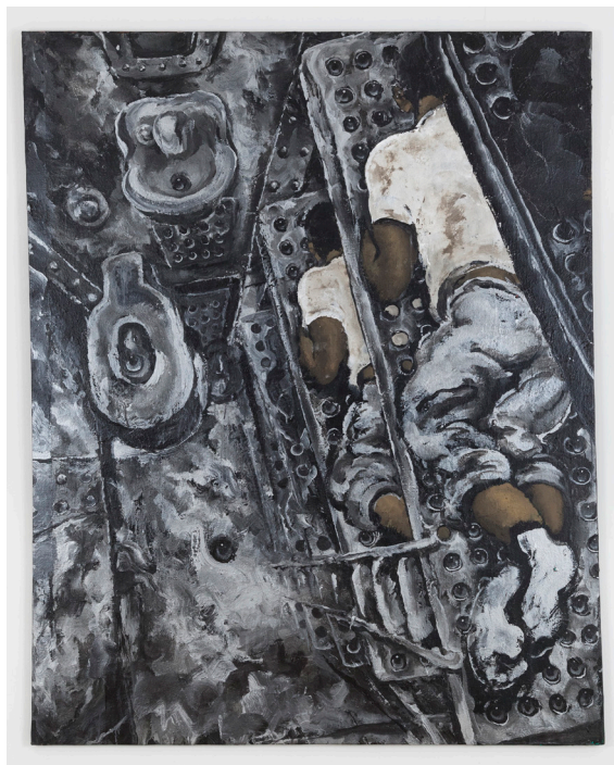
Martin Wong Prison Bunk Beds , ca. 1988—91 Acrylic on canvas 152,4 x 121,9 cm Courtesy of the Martin Wong Foundation and P.P.O.W, New York © Martin Wong Foundation