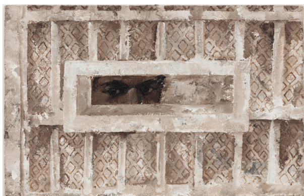
Martin Wong Cell Door Slot , 1986 Acrylic on canvas 45,7 x 71,1 cm Courtesy of the Martin Wong Foundation and P.P.O.W, New York © Martin Wong Foundation