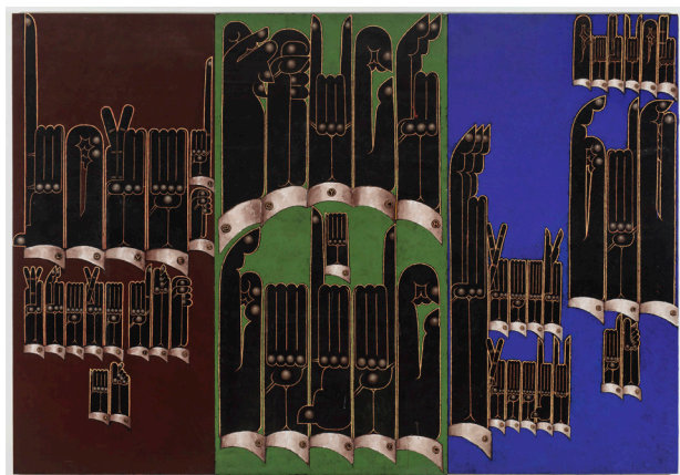
Martin Wong Psychedelic Triptych , 1988 Acrylic on canvas, triptych 242,9 x 350,5 x 4,6 cm