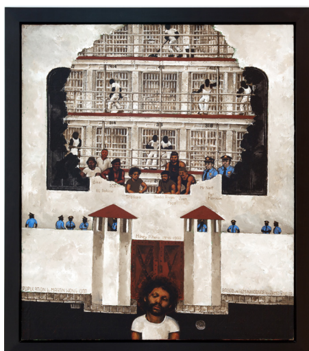
Martin Wong Penitentiary Fox , 1988 Acrylic on canvas 162,6 x 142,2 cm Courtesy of the Martin Wong Foundation and P.P.O.W, New York © Martin Wong Foundation