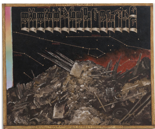
Martin Wong Everything Must Go , 1983 Acrylic on canvas 121,9 x 152,4 cm Courtesy of the Martin Wong Foundation and P.P.O.W, New York © Martin Wong Foundation