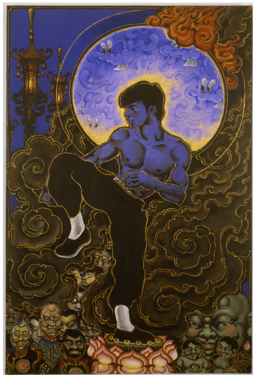
Martin Wong Bruce Lee in the Afterworld , 1991 Acrylic on canvas 182,88 x 122,56 cm