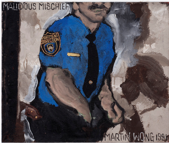
Martin Wong Malicious Mischief , 1991 Acrylic on canvas Courtesy of the Martin Wong Foundation and P.P.O.W, New York © Martin Wong Foundation